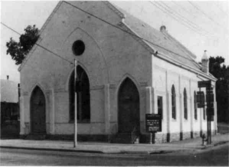
Fairfax Church building in Winchester, Kentucky. Constructed in 1891