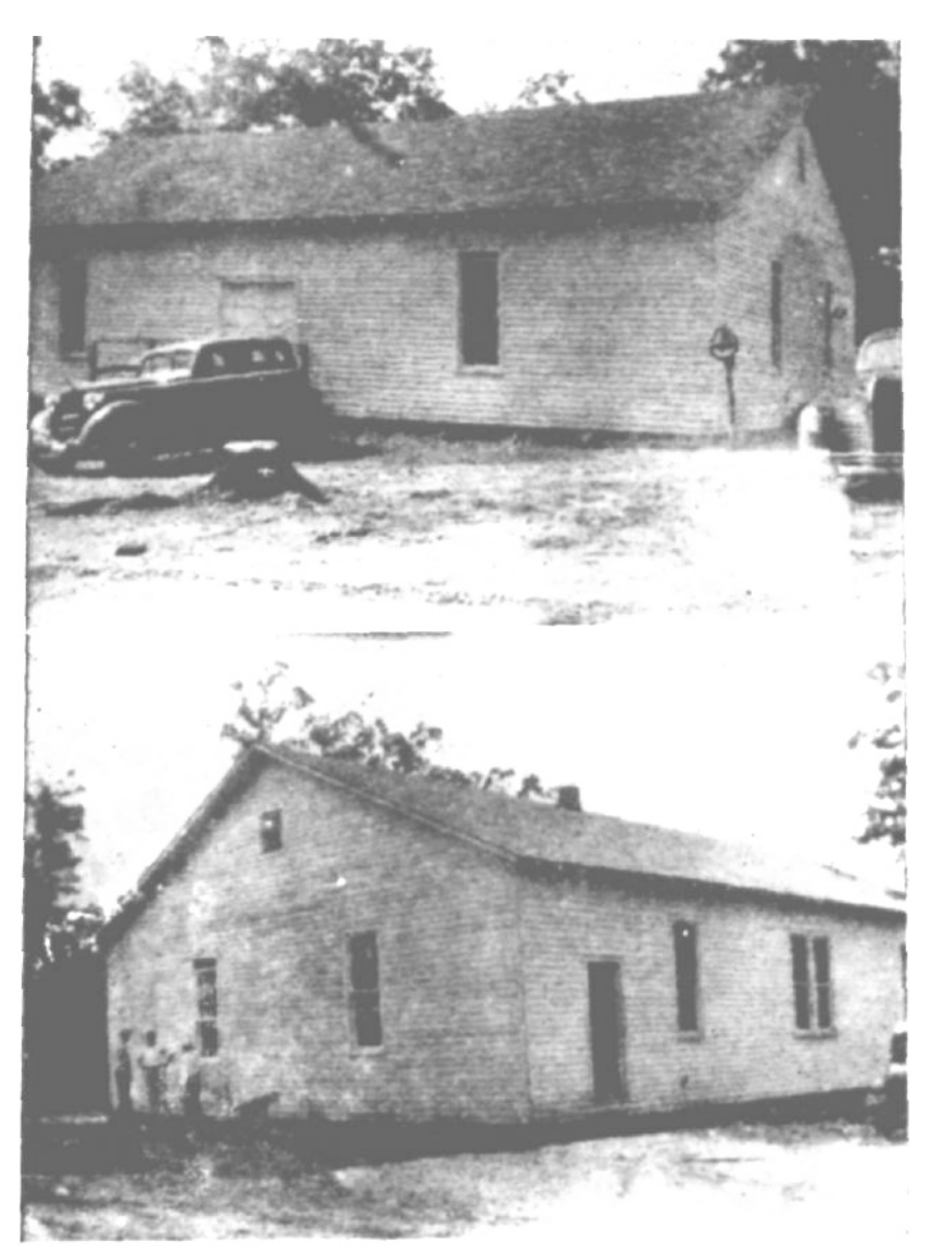
CEDAR HILL BAPTIST CHURCH. Top view made from the Southeast corner. Bottom picture made from Northeast corner about thirty minutes after the debate was over Friday afternoon.